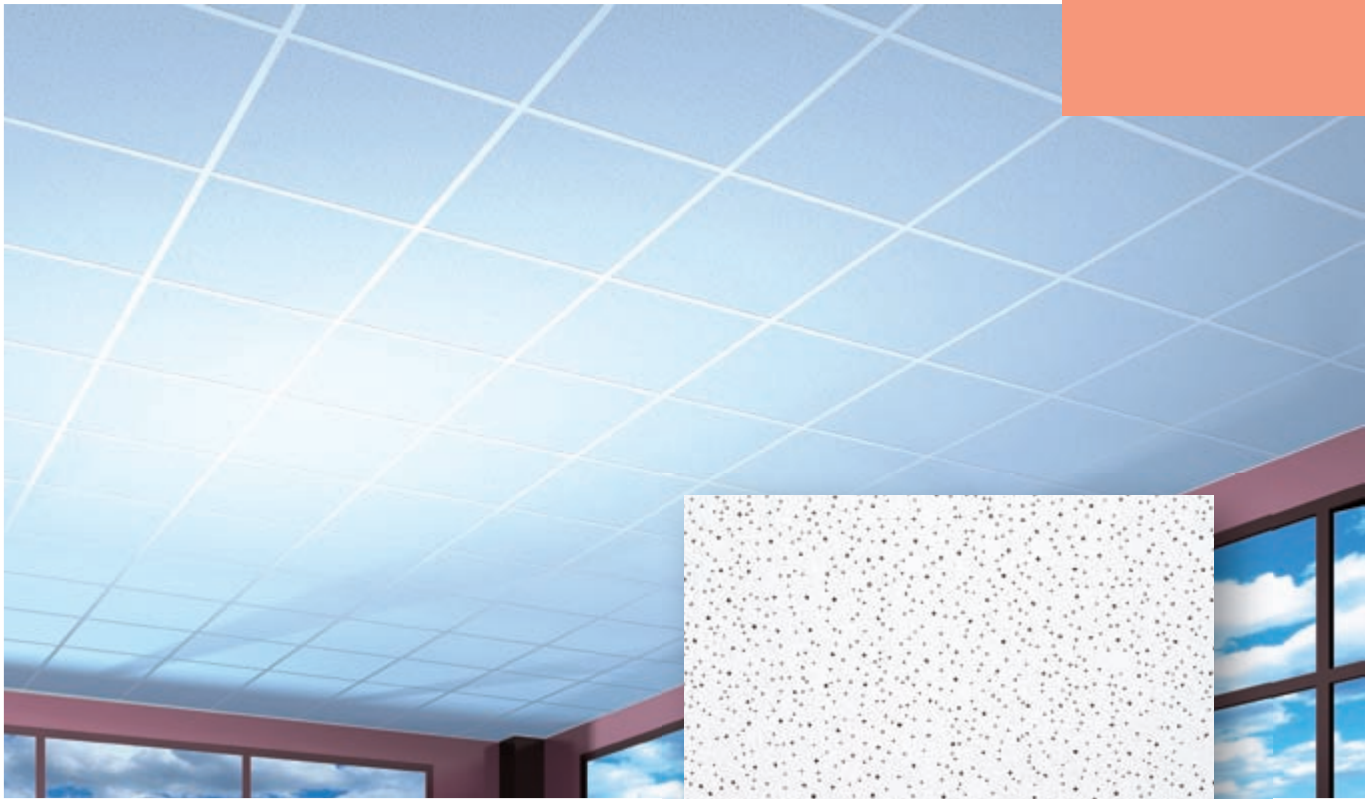
Surface pattern Finetta Finetta 62